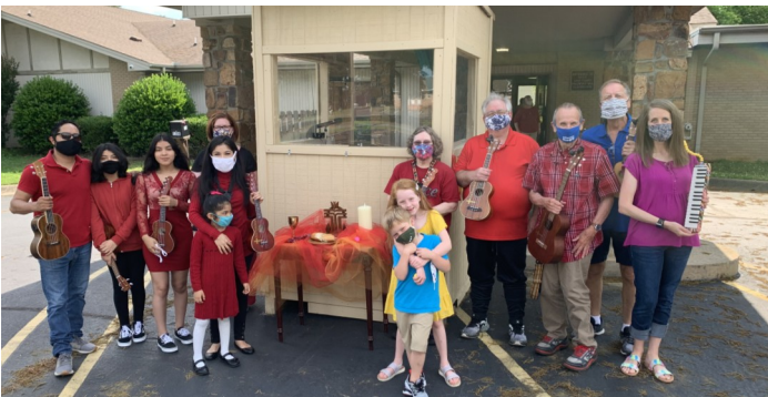
This picture was taken after COVID-related space restrictions had eased

During the COVID pandemic, the FPC Ukulele Band played for worship in the parking lot while maintaining safe distance between each family. Continuing to meet and practice as the rest of the world was shutting down, the band brought joy to many during a time of sadness and heartbreak. The music was broadcast via radio and each car in the parking lot could tune in to hear it on their radio as they watched the band play from a safe distance. Recorded performances were published online for those who could not attend. Music sheets were attached to the videos so people at home could play along, read the words, and practice the chords. Watch this parking lot performance at https://www.youtube.com/watch?v=PUa_7yVjZl4