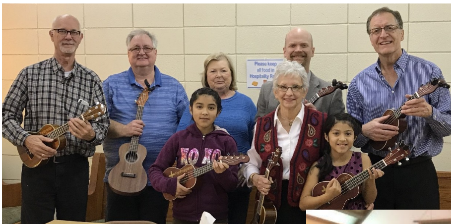
The Ukulele Band's first practice on January 28, 2018

It all worked out as planned. The ukes were ready and it seemed pretty easy to get a few interested folks together to see who wanted to give it a try. Our first practice was on January 28th, 2018.”