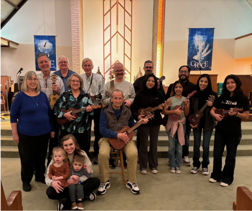
The First Presbyterian Church of Jacksonville Ukulele Band