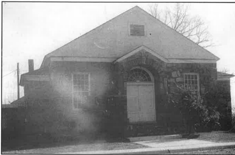
First Presbyterian Church in Jacksonville in its completed state located on Oak Street and South Road.

We will be celebrating our 100 th Anniversary in October. As we prepare to commemorate our heritage we will remember how God has been with us through the ages. We will look back at our lives and the life of our church as we give thanks to God for the ways God has sustained this church and